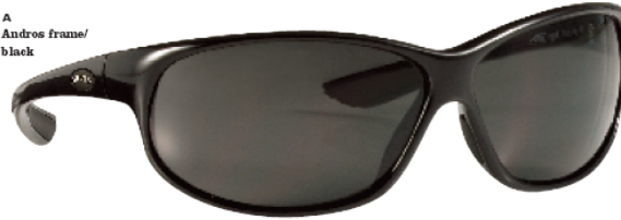
A Andros frame/ black