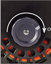
FIGURE 1: Increase resistance by turning drag knob clockwise.

Your SSR DISC Reel features a dependable center-line drag system. To adjust the drag, turn the knob (FIGURE 1) clockwise to increase resistance, and counterclockwise to decrease it. The minimum drag setting should never be less than the pressure required to prevent over-running of the line on fast runs. Additional drag may be applied by palming the spool rim with your fingers or palm. The easy drag adjustment is infinitely variable, providing wide-ranging and controllable settings.