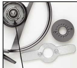
FIGURE 2 (PARTS 24 & 25)

NOTE: When not in use, the drag should be loosened completely.