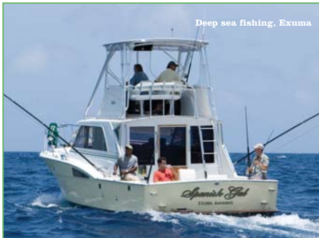
Deep sea fishing, Exuma