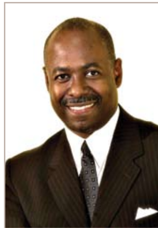
The Honorable Obie Wilchcombe, Minister of Tourism

Welcome to The Bahamas Fly-Fishing & Adventure Guide. We are very excited to partner with Orvis, a sporting lifestyle leader. This incredibly complementary pairing will present you with the finest adventures in The Islands Of The Bahamas and the best gear to pursue your dreams.