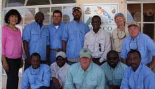
2006/07 Orvis Bahamas Fly-Fishing Certified Guides